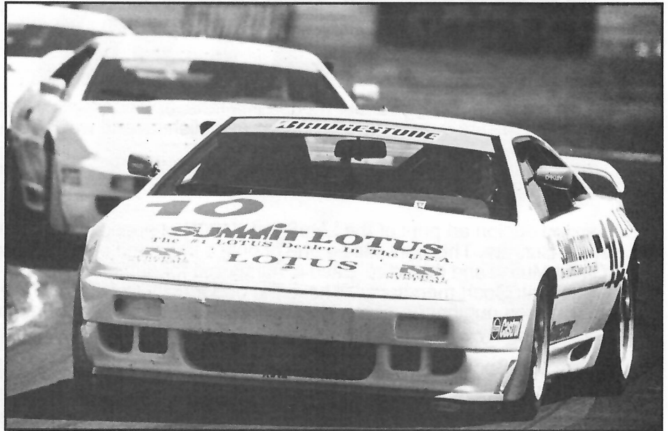
Doc drives Summit Lotus No. 10

"Once I got close to him, he didn't go as quickly because he was